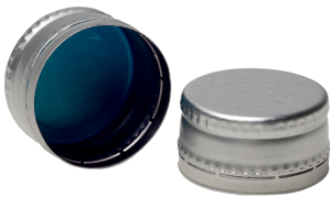
ALUMINUM CAP 28MM X 15MM MCA MC010