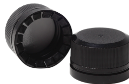
28MM BLACK PLASTIC CLOSURE CD002