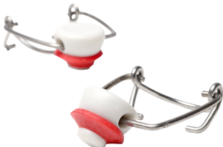
SWING STOPPER SW002