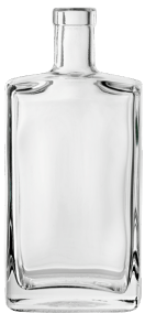
GRANDEUR 750ML SP072