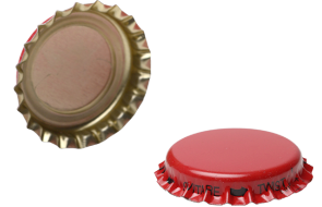
26MM RED TWIST-OFF CROWN CAP BC007