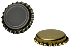
26MM GOLD TWIST-OFF CROWN CAP BC003