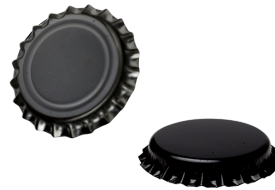
26MM BLACK TWIST-OFF CROWN CAP BC005