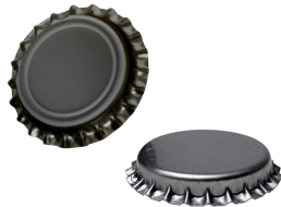
26MM SILVER TWIST-OFF CROWN CAP BC004