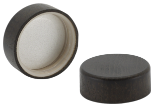
GPI 33/400 WOOD HEAD 39MM X 15MM CLOSURE CD079