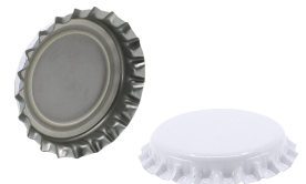
26MM WHITE TWIST-OFF CROWN CAP BC008