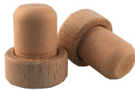
BAR TOP WOOD FINISH 29MM X 13MM X 19.5MM CD050