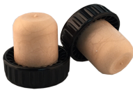
BAR TOP BLACK PLASTIC FINISH 29MM X 10MM X 19.5MM CD051